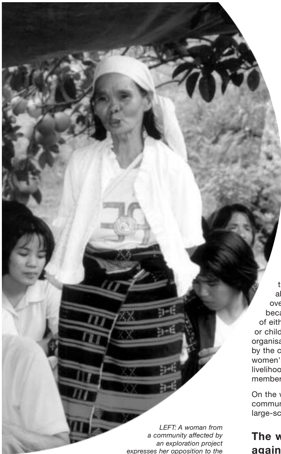
LEFT: A woman from a community affected by an exploration project expresses her opposition to the project in a community meeting in the Philippines.