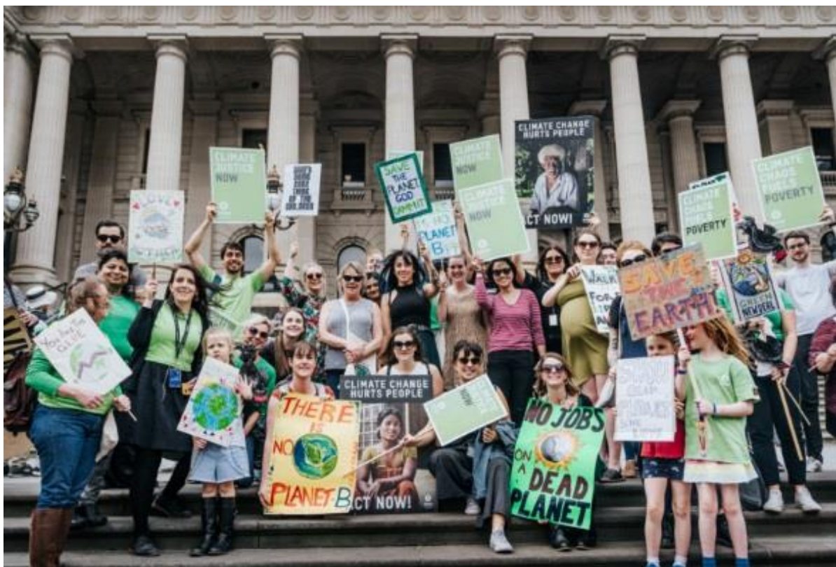
OAU Staff and Volunteers attending the Global Strike for Climate 20 September, 2019.

Oxfam and Volunteer Managers should continue to encourage volunteers in engaging in activities which support the work of Oxfam. This promotes further engagement of volunteers, enables volunteers to build relationships and networks with other teams/sections of the organisation and encourages a more positive volunteering experience.